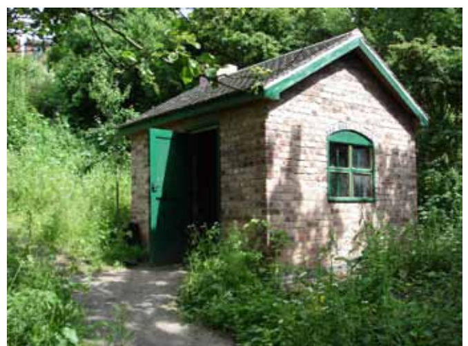
Brick summerhouse

However, the most important status symbol was a summerhouse, as described in this book of 1840: