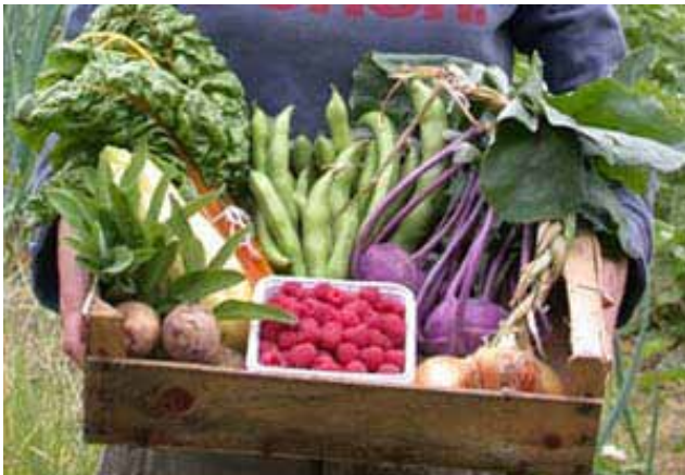
Veg box

You might be surprised to know that the surrounding neighbourhood of St Anns does not have a greengrocer or supermarket selling fresh vegetables.