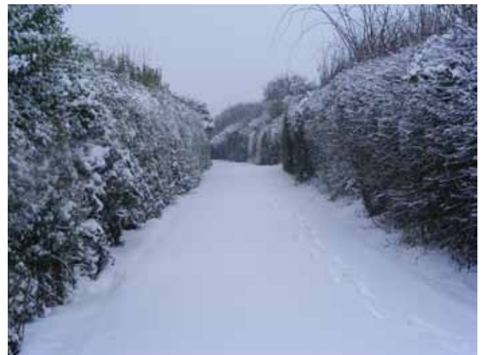
Avenue in the snow