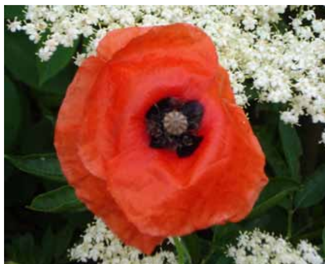
Wild poppy

Do go up the pathway and explore if you are interested. You can see an old well that has been excavated and examples of hedge laying using traditional techniques.