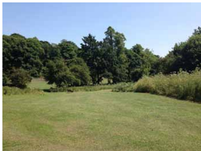
Coppice Park today

Over time many of the trees of The Coppice were cut down and the wood used in Nottingham by both people and industries. For many years this area was part of the allotment site.