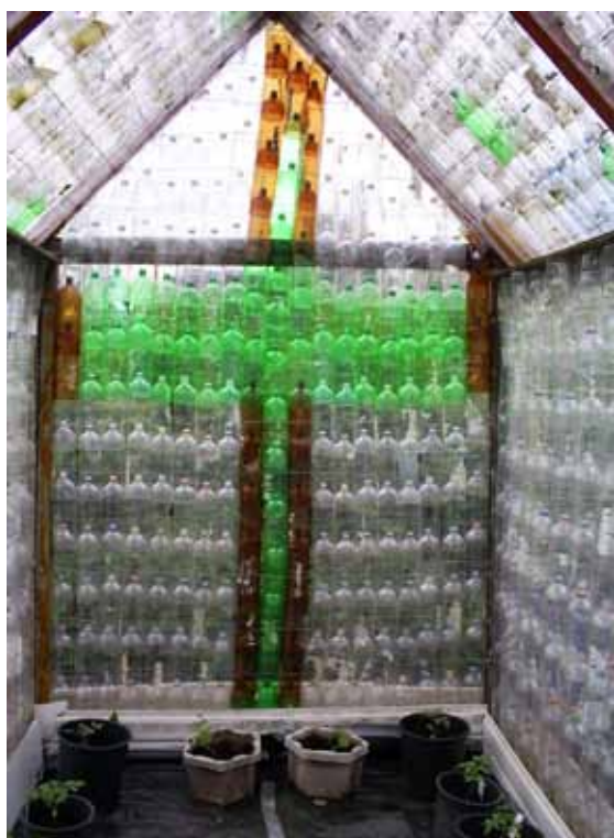
Greenhouse made of plastic bottles