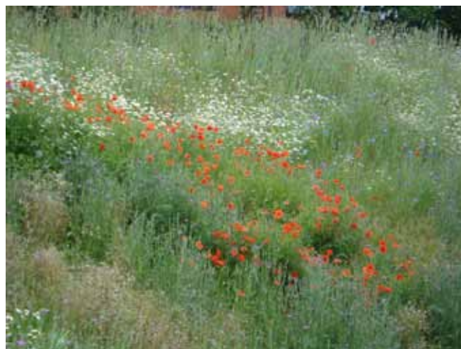
Wildflower meadow by the Visitor Centre

Many plants and animals that struggle to survive on intensively-managed farmland find a refuge in green spaces like this in the heart of urban areas. The whole allotment site is now designated as a Site of Interest for Nature Conservation (SINC).