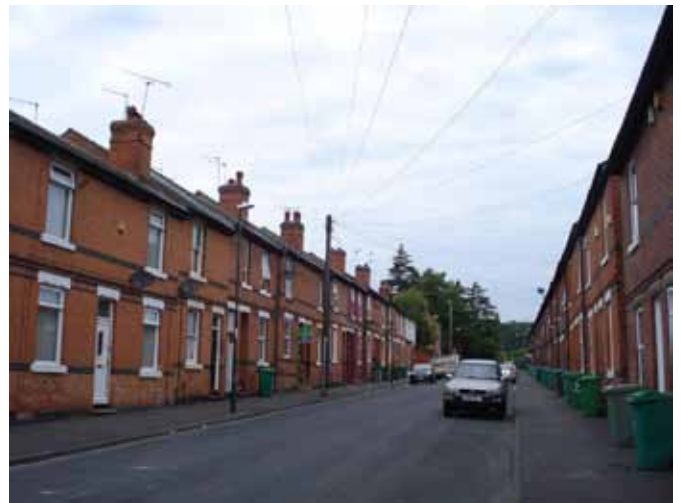
Victorian terraced housing in Chandos Street

Meanwhile the area of St Anns here was developed for working class housing and industry. The rows of terraced houses to the south of the allotment site are the remnants of this development.