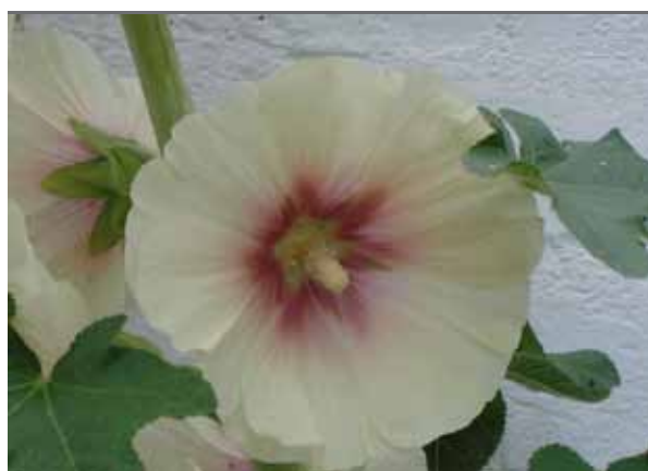
Scenes from around St Anns Allotments