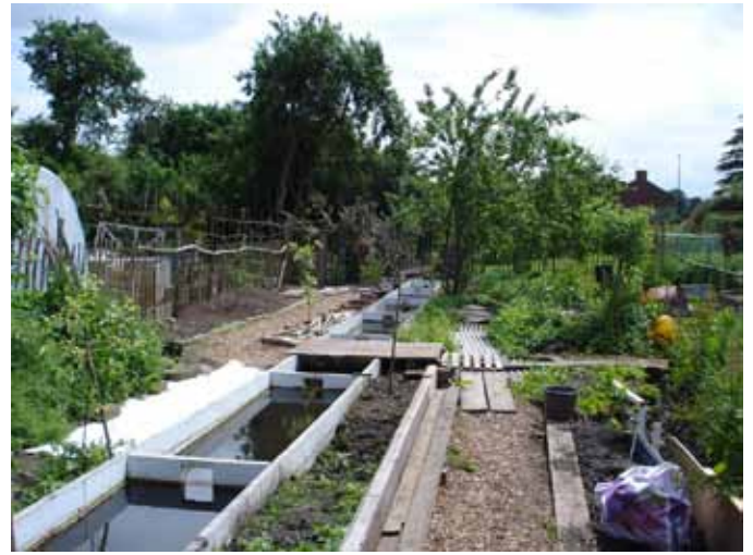
The restored Rag Beck running through Garden B385/6

It is possible that some of the stories have been confused with nearby St Ann's Well which was a place of pilgrimage but the Beck definitely had a curative reputation in its own right.