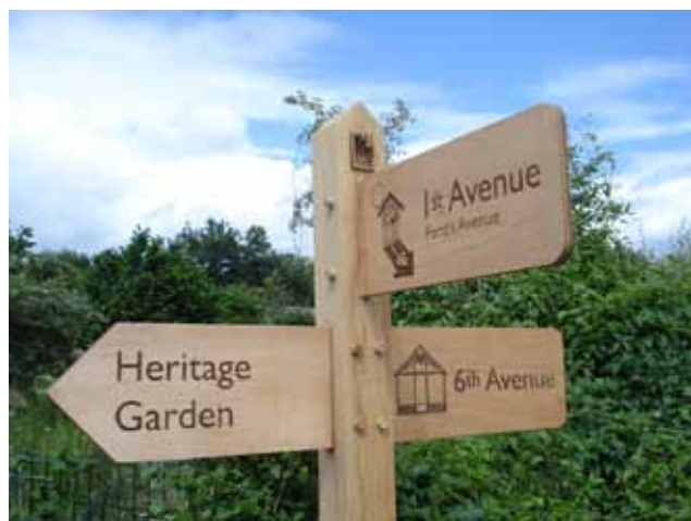
New signage around the site

The site was awarded English Heritage listing. They have secured major investment to make the site viable.