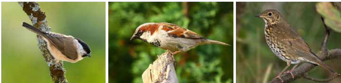
Some of the birds found on site (left to right): marsh tit, house sparrow, song thrush

Among the success in terms of insects is the clear-winged moth whose larvae feed in the stems of currant and gooseberry bushes. They have not been seen in Nottinghamshire in 100 years but have made a comeback on this site.