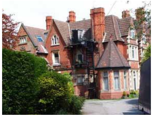
Victorian villa on The Crescent, Alexandra Park

Up the hill and to the left is an area called Alexandra Park in the Mapperley part of the city. Depending on the time of year you may be able to see the tops of some houses.