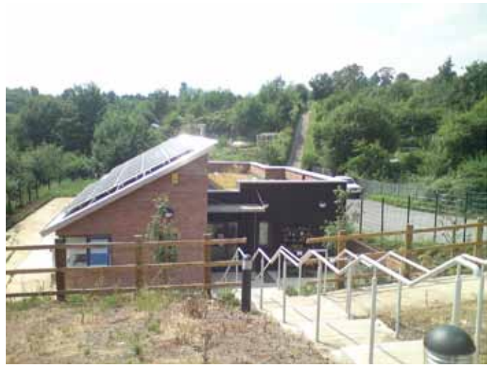
New Visitor Centre

Some of the campaigners were experienced activists and got a lot of local publicity. They also convinced national personalities to support them such as television gardener, Monty Don. What we can see today is the result of their campaign which succeeded against all odds.