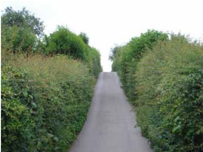
Hedges either side of Gentleman's Avenue

You might think that the hedgerows all look the same but look a little closer and you will find that they are made of different species. Depending on the season you might see privet, hawthorn, hops, sycamore and vines.