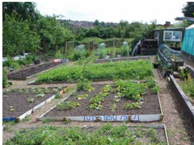
Vegetable plots in Garden B385

This walk tells the fascinating story of this site that has been cultivated for the last 700 years, and its transformation from church land to Victorian leisure gardens, and from working-class allotments into a community resource.