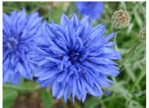
Colourful flowers