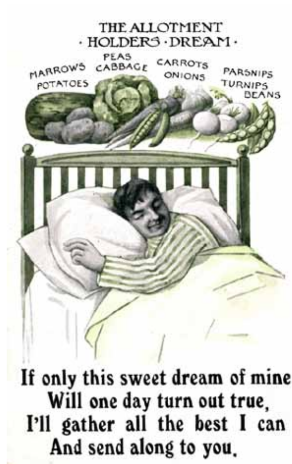
The Allotment Holder's Dream © Garden Museum