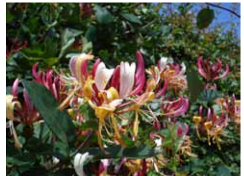
Hedgerow flowers - sweet pea, elderflower and honeysuckle