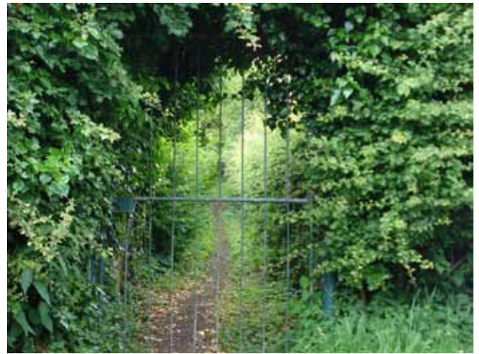
Gated pathway

You will have noticed that every garden is surrounded by high hedges which are "well-trimmed...not to exceed five feet" according to the rules.