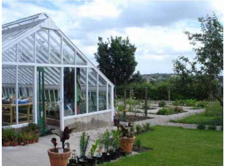
Victorian glasshouse and formal garden

This walk takes you around a remarkable green space in Nottingham that has recently been awarded Grade 2* Listed status. It is the oldest and largest area of Victorian detached town gardens in the world.