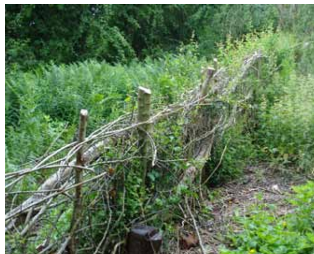
Traditional hedge laying techniques in Stonepit Copse

Allotment tenants can buy bean poles and pea sticks made from coppiced wood. Willow wands are also available for fencing, hedges, and baskets. The new coppice is also a haven for wildlife.