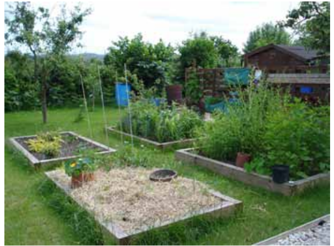
21st century section in Display Garden

Some sections are left uncultivated as wildlife areas to attract a range of species of flower, insects, birds and small mammals.