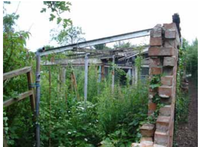
From the 1960s onwards many of the plots were abandoned

Fourth there was a change in the focus of family leisure time away from spending time outdoors; in particular the television became a focal point of the home.