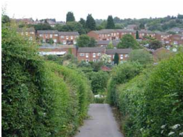
Housing estate built in the 1960s on a hillside once covered by gardens

Allotments became the preserve of the retired man while some of the gardens became overgrown and attracted vandals and thieves.