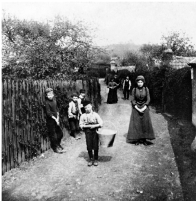
Woman and children on avenue in Hungerhill Gardens (c.1860s)

The wealthy with their new villas no longer needed detached gardens here at Hungerhills so they were taken on by the people who had moved into the new housing in St Anns.