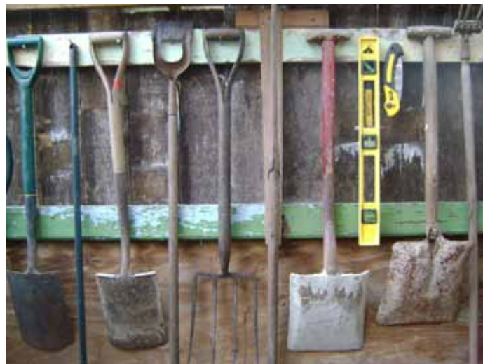
Garden tools

Another example of their activism was when the Council tried to sell some of the gardens for housing. The Association organised a successful petition. Today the Association runs a small shop on Ford’s Avenue selling seeds and compost to its members.