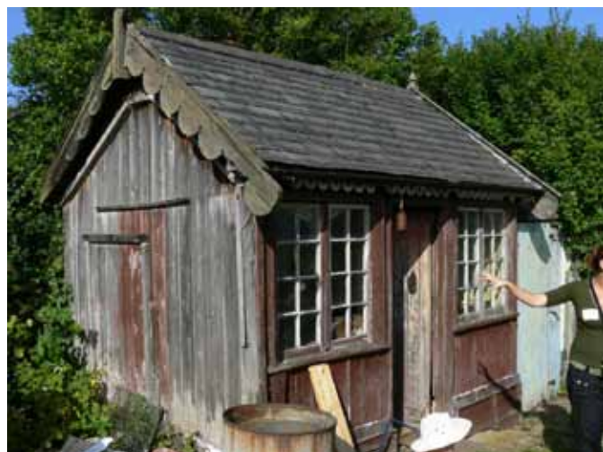
Listed wooden summerhouse in Garden B305

Not only do we have the old Victorian summerhouses but people continue to build structures on their plots. There are strawbale buildings, mud huts and other temporary constructions. See what you can spot.