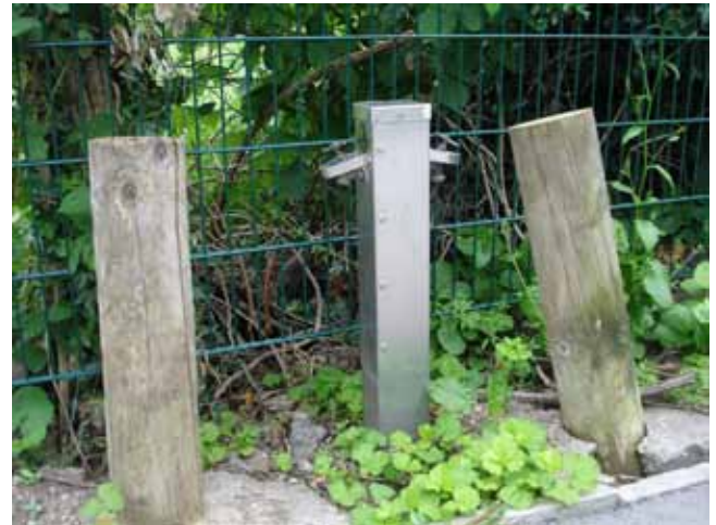
Borehole taps

They have also excavated a round Victorian well at least 14 feet deep. If you would like to see the Beck and well you can arrange access to this garden at the Visitor Centre.