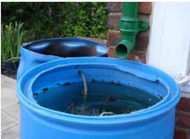
Collecting rain water in butts