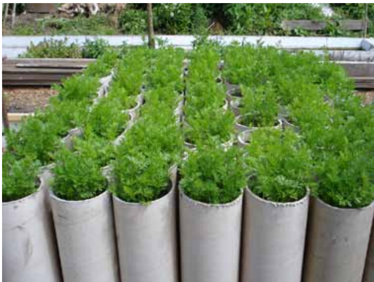
Carrots being nurtured

Discover how it has changed over time from common ground to Victorian leisure gardens and from working-class allotments to community resource.