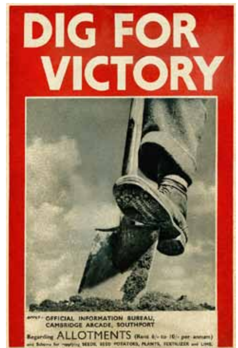
Dig For Victory poster

"We put the plough through a field of some hundred thousand trees – a heart-breaking job. We tore from the glasshouses the bushes that were to give us blooms for the spring flower shows, and so made room for the more urgent bodily needs of the nation."