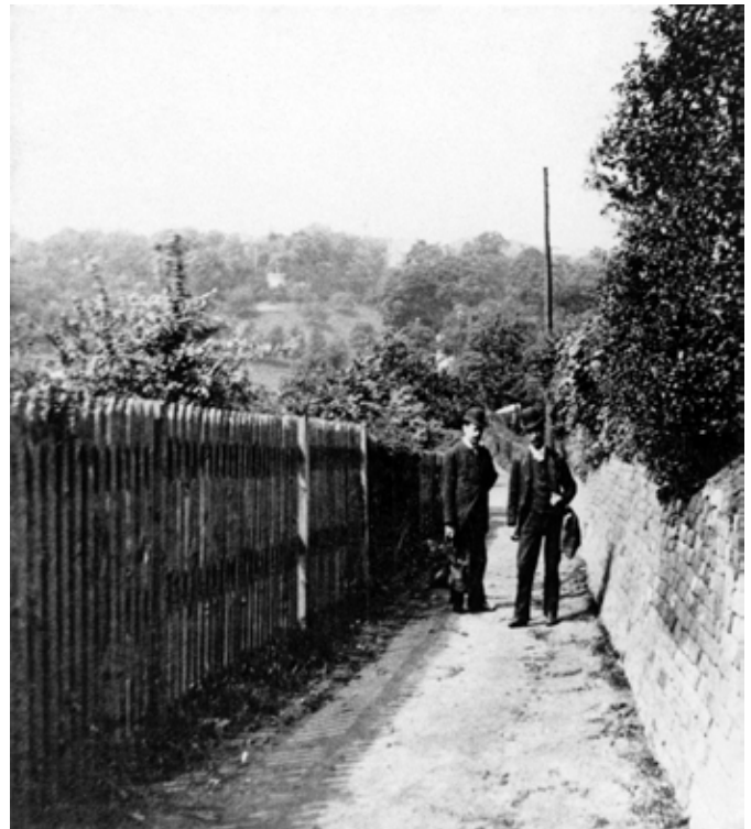
Two gentlemen on an avenue in Hungerhill Gardens (c.1860s)

We are at the bottom of an avenue nicknamed ‘Gentleman’s Avenue’. It was the most popular area to rent gardens in the nineteenth century because the gardens were on relatively flat land and south-facing. It is one of only two paths on the site with a name, the other being Ford’s Avenue which we will walk along soon. All the other avenues on the site are numbered 1st to 14th which is believed to be the original Victorian labelling system.