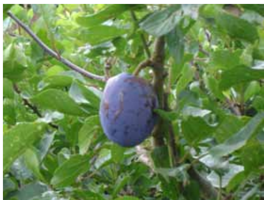
Damson plum © STAA

Similarly they earmarked another section on the east side of the site to create Sycamore Park. There are Council records showing long-running debates about the tensions caused by the plans to requisition these gardens.