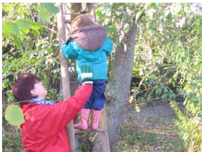
The Community Orchard and popular schools programme