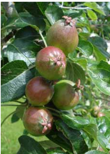
Apple tree

Now look through the gap in the hedge to the plot below which is planted as an orchard. Ever since the Burgesses set up their gardens here there has been a long history of growing fruit trees on this site.