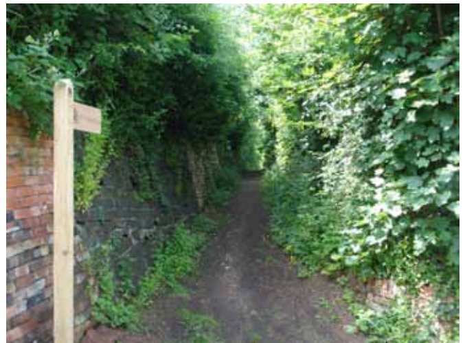
7th Avenue, one of the oldest pathways on the site

In 1605 there are records that the Nottingham Corporation leased two or three acre plots to 30 Burgesses (or freemen) of the town. The plots were referred to as Burgess Parts.