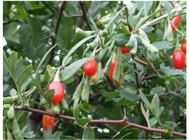
Duke of Argyll Tea Tree berries

It has a small purple flower and bright orange berries on a slim, thin silver-leafed trailing plant. The flowers appear in June or early July and the berries in late July. So if you are here at one of those times do have a look in the hedgerows for them.