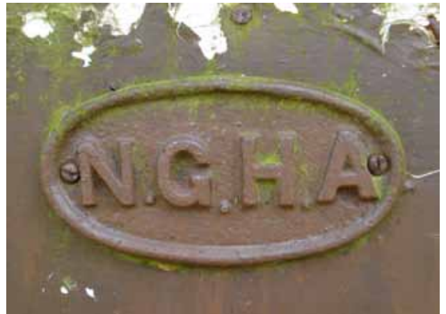
NGHA sign on Garden B283

Here on the gate of Garden B283 is an old sign with the letters NGHA; you will see others around the site too. It stands for Nottingham Garden Holders Association. Allotment tenants could choose to become members of this organisation which was established in 1883.