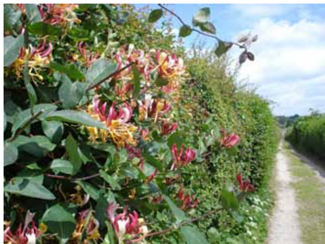
Honeysuckle along the hedgerows

By discovering how this landscape has changed over time in its ownership, management and use we will find out more about the social history of Nottingham. Hidden in the avenues and plots, hedgerows and plant life is a remarkable history.