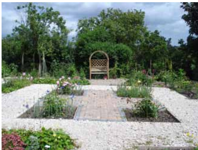
Formal Victorian garden within the Display Garden

“Every garden has its summerhouse; and these are of all scales and grades, from the erection of a few tub-staves, with an attempt to train a pumpkin or a wild hop over it, to substantial brick houses with glass windows, good cellars for the deposit of choice wines, a kitchen, and all necessary apparatus, and a good pump to supply them with water.”