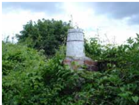
Tantalising glimpses of old summerhouses around the site

Before continuing, look for the top of a small wooden summerhouse above the hedge to the left of 9th Avenue. This has a typical façade of a Victorian summerhouse. Look out for more glimpses of interesting buildings and structures as you walk along 9th Avenue.