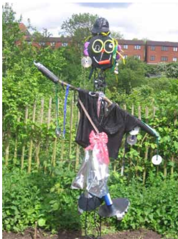
Scarecrow made of recycled items