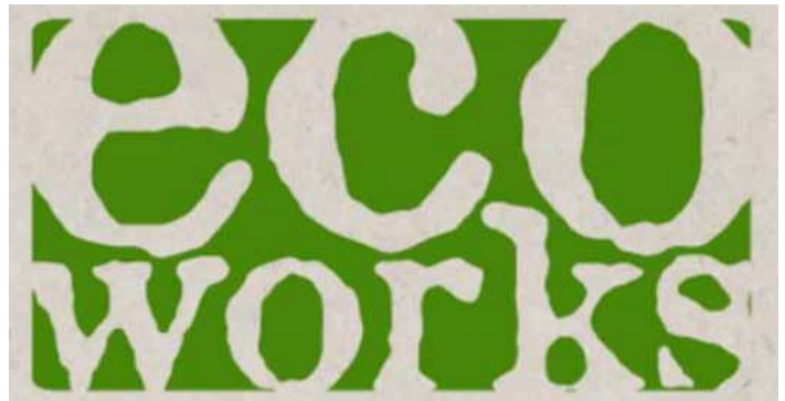
Ecoworks logo

From here we can see the plots of Ecoworks, a charity that supports people who are socially-disadvantaged and vulnerable with activities connected to conservation, restoration and the environment.