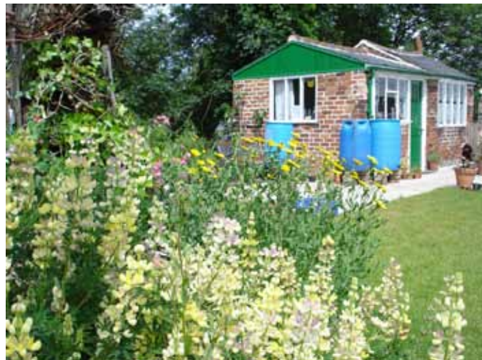
Flowerbeds and summerhouse in the Victorian Garden

The substantial glasshouse was probably made in the nineteenth century by Foster and Pearson, a garden building manufacturer based in Beeston on the outskirts of the city.