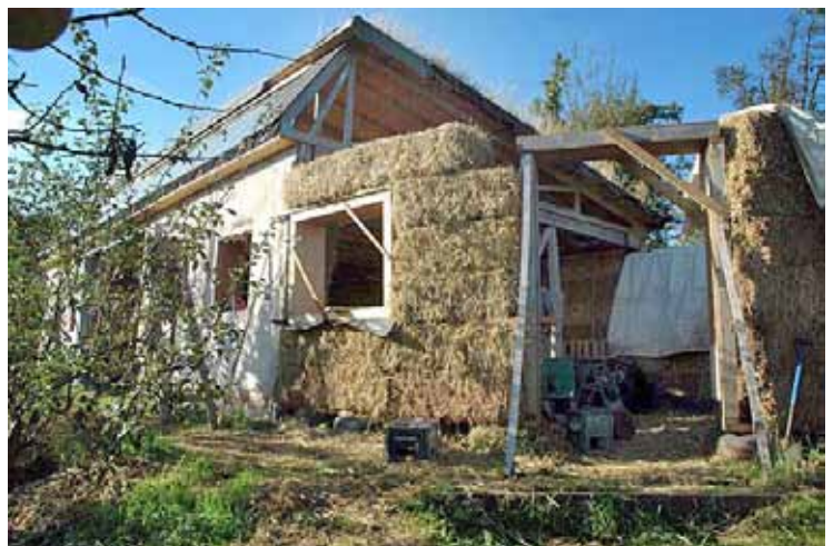
Ecoworks strawbale building under construction

The Ecoworks garden also has two restored Victorian wells and a summerhouse.