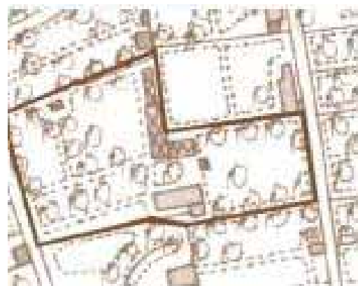
Mr Weisbloom's house and gardens shown on a map of 1882 Ordnance Survey

According to the 1861 census 205 people lived here in the gardens, an increase of 112 on the previous census ten years earlier. Other documents show more people living on the site but they were not noted on the census. The census notes the occupations of the residents; these included a cordwainer (shoe repairer), staymaker (maker of corsets), Chelsea pensioner, cigar maker and coach body builder.